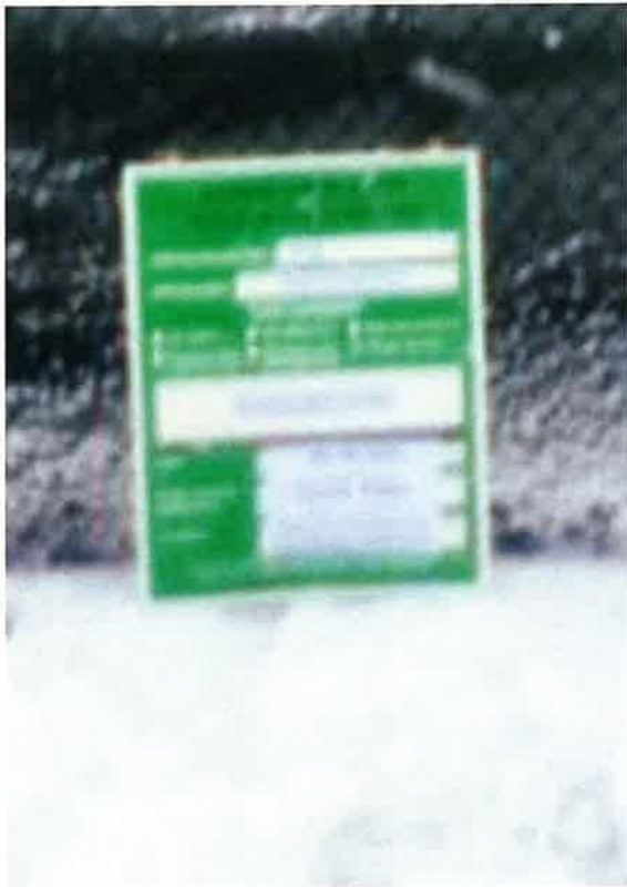
1/3/2022 – S ST SW