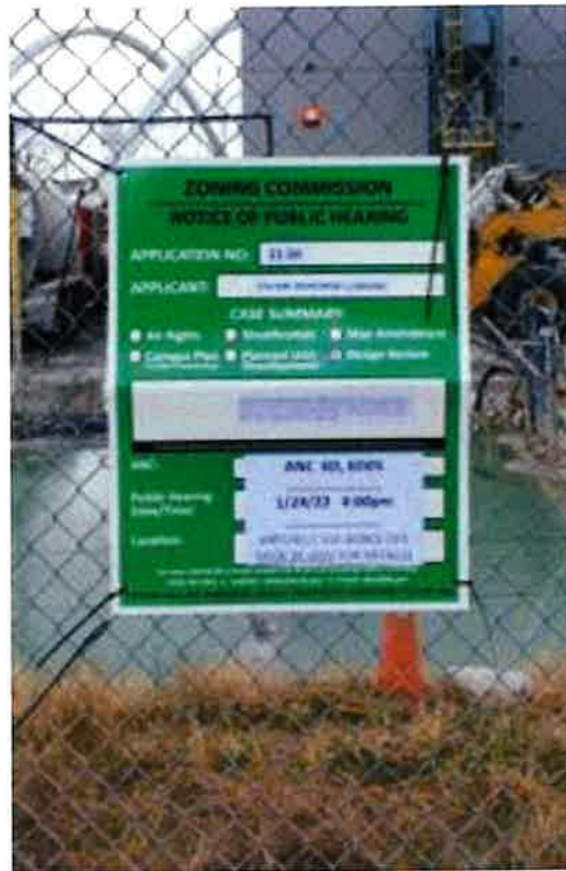
1/18/2022 – HALF ST SW